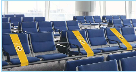
DIRECT PRINT TO VINYL OPTION SHOWN ABOVE