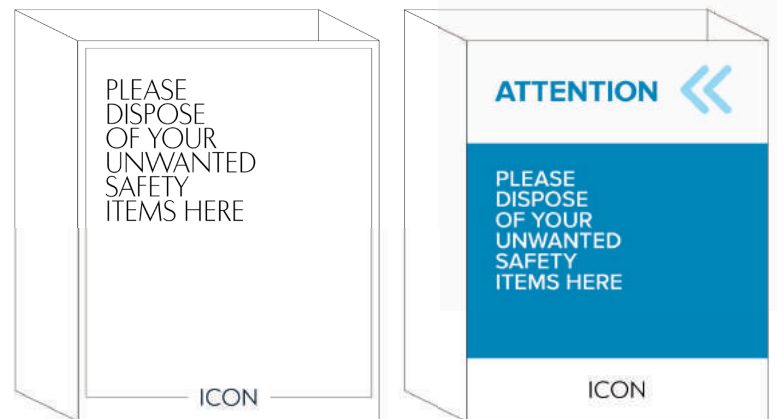
BOX FOR SAFETY ITEMS DISPOSAL